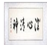
澄心清神 105.5 x 46 cm HKD2000